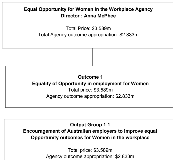
Figure 4: Contributions to outcomes

The relationship between activities of Equal Opportunity for Women in the Workplace Agency and the outcome is summarised in Figure 4.