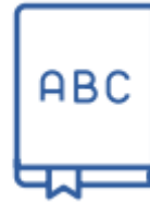
Early childhood teachers

Support children in their education and recreational activities, and their overall learning and development